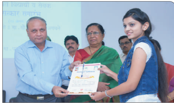
Felicitation of Meritorious Students