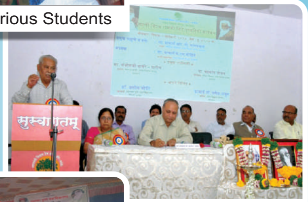
A Talk To Commemorate V. R. Shinde Death Anniversary