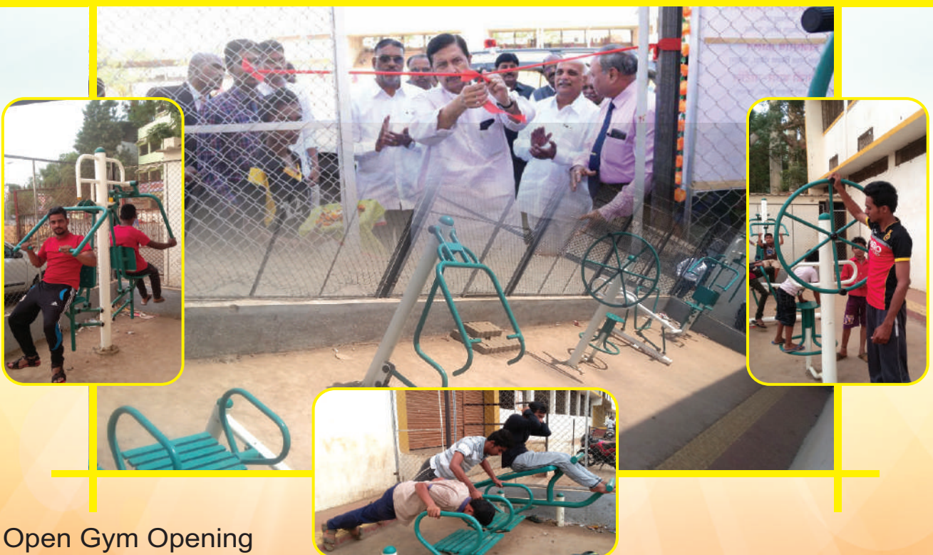
Open Gym Opening