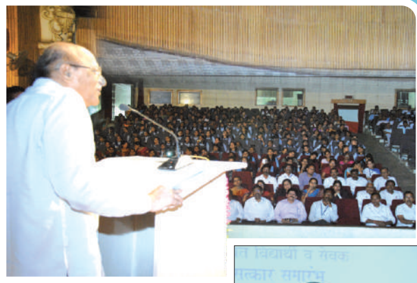
Karmaveer Birth Anniversary Celebration