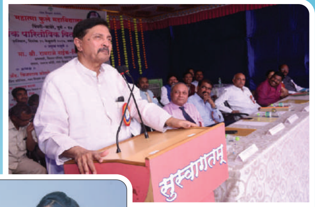
Annual Prize Distribution Ceremony