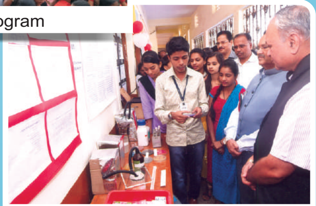
Short Term Courses And Science Exhibition