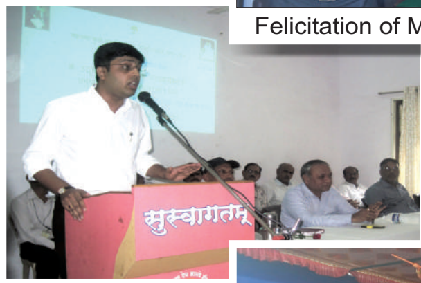
A Talk To Students Appearing For Competitive Examination