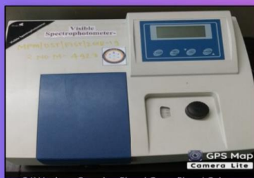
UV Visible Spectrophotometer