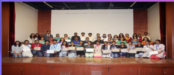
M.Sc. Students participated in Conference