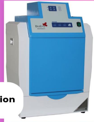
Gel Documentation System