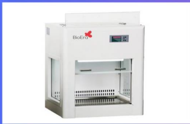
Laminar Air Flow