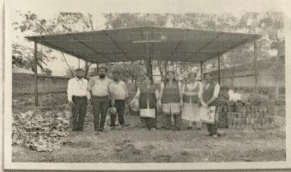
Collection of garden waste for recycling by Vermicomposting Method