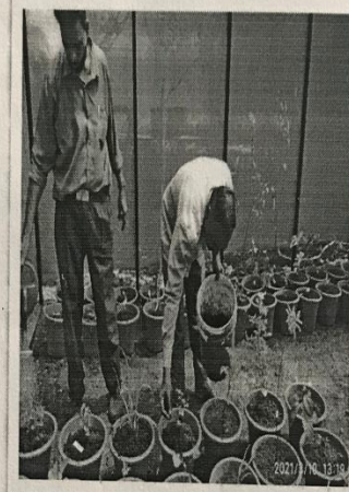
Harvested vermicompost is utilized for Polyhouse garden plants and mango and coconut trees.