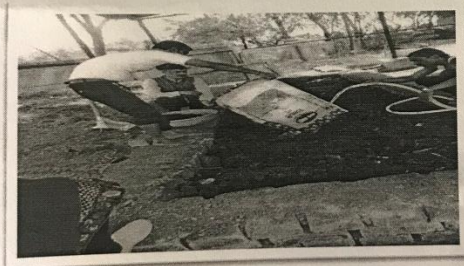
Preparation of vermicomposting bed