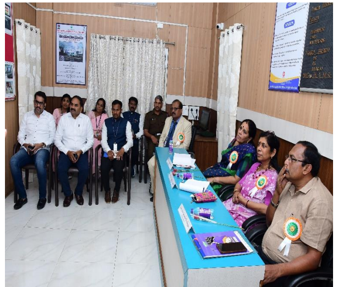
IQAC Coordinator's Presentation and Interaction with the Members