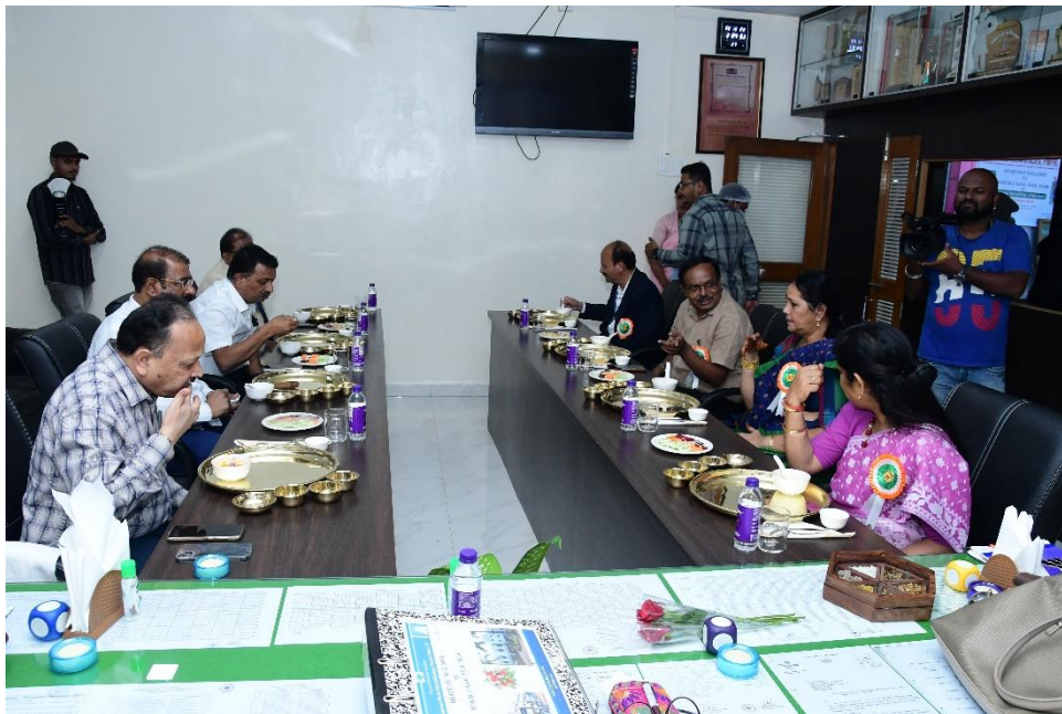
Lunch on Meeting with Management Authorities and University Representative