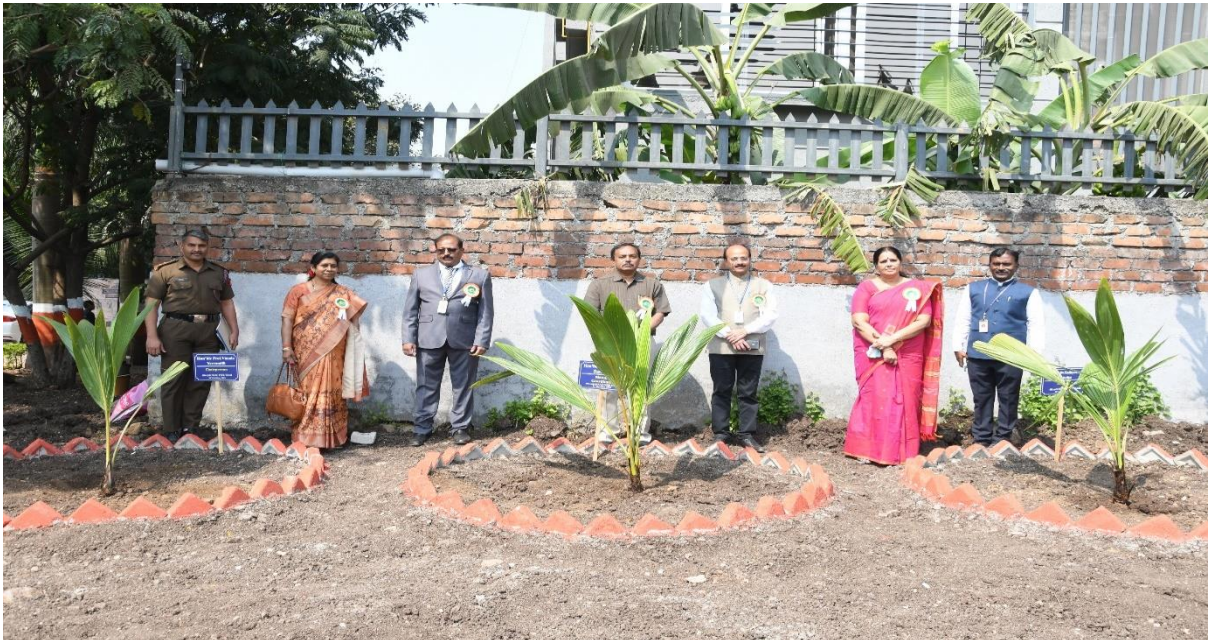
Tree Plantation Drive with Auspicious ends of the Hon'ble Peet Team