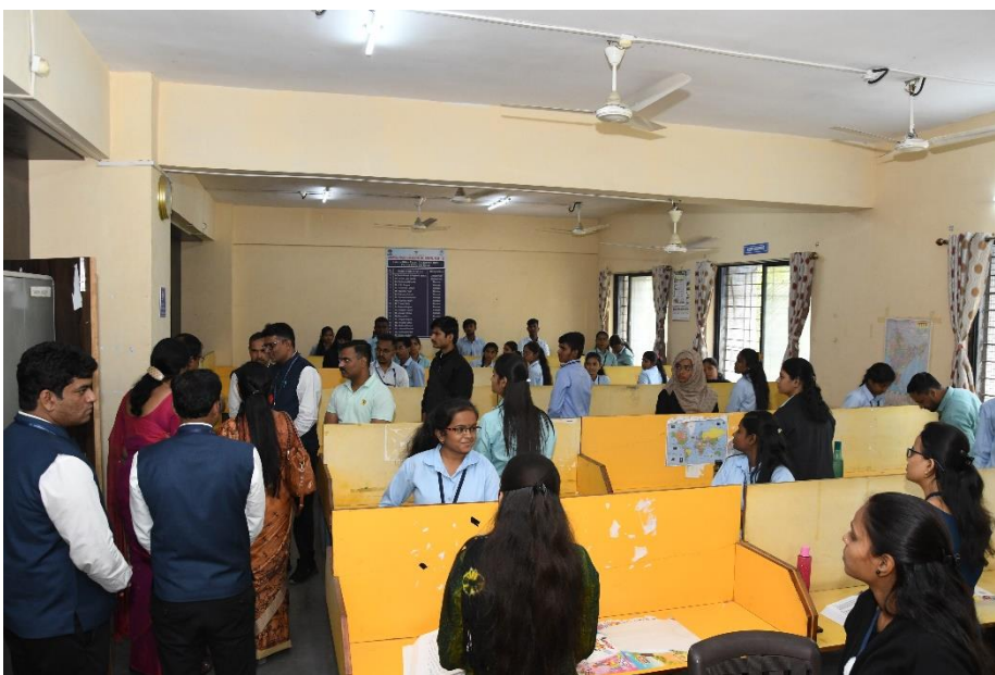
Visit to the Reading Hall (Competitive Examination Centre)