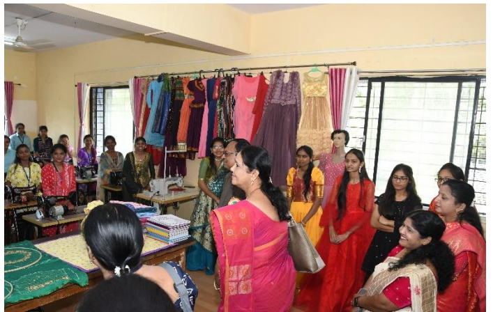
Visit and Interaction to the Certificate Course in Fashion Designing