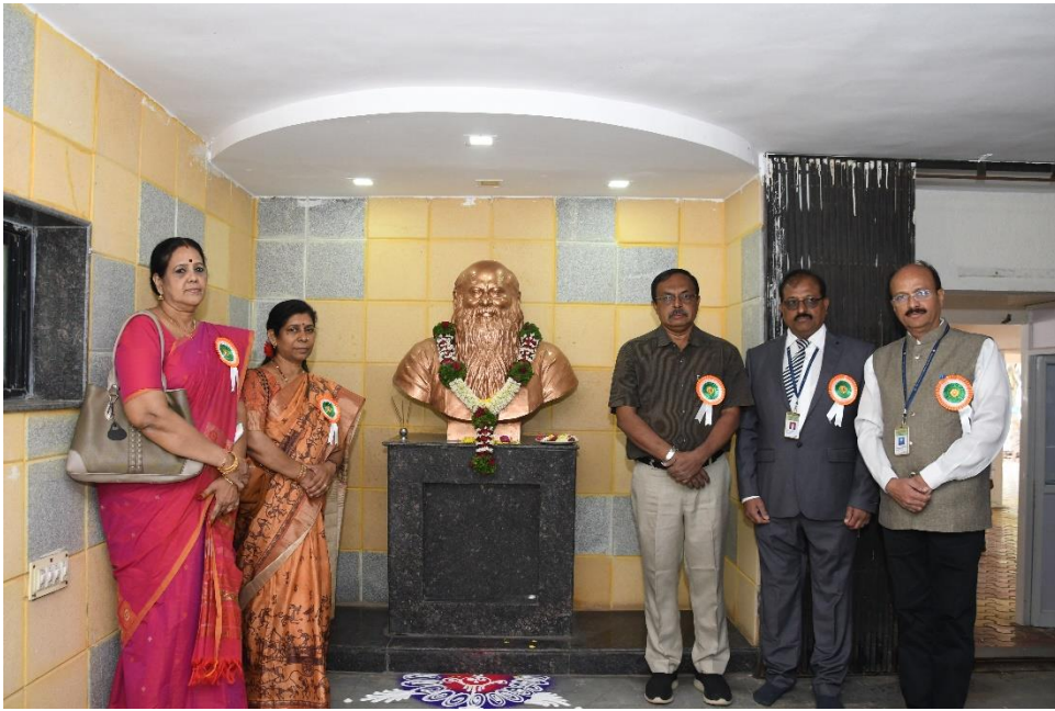
Pooja Offerings to the Founder's Statue of the Parent Institute at Campus II