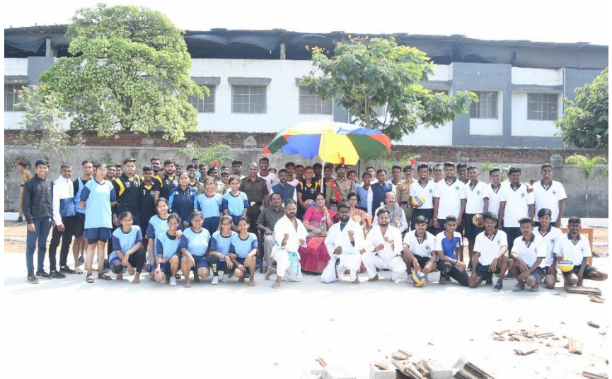
Sportsperson Students' Demo