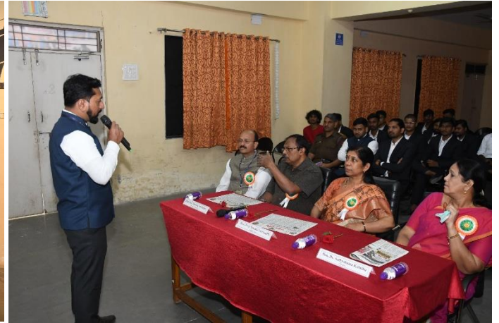
Visit and Interaction to the Department of Mass Communication