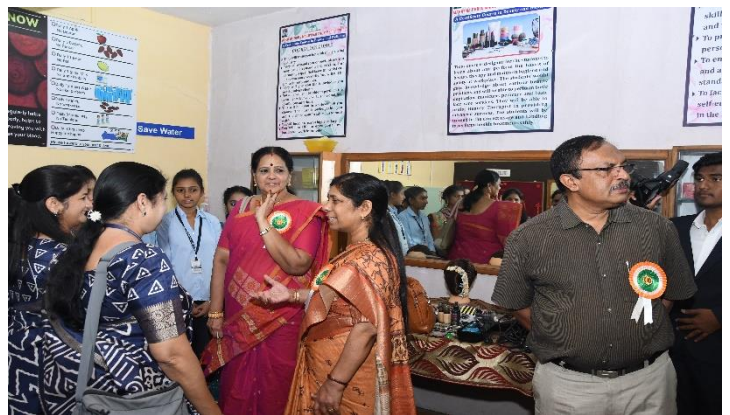
Visit and Interaction to the Certificate Course in Beauty and Wellness