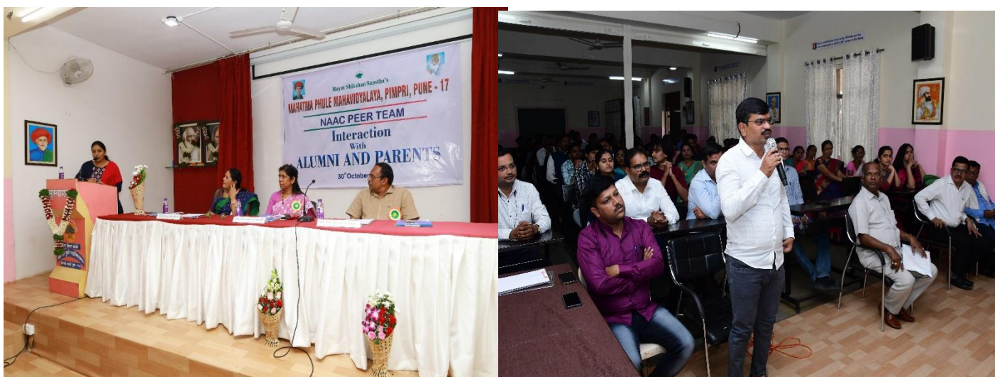
Interaction with Alumni and Parents