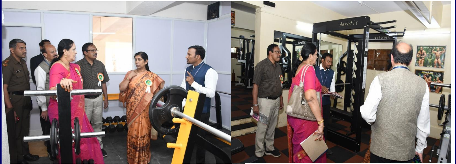
Visit to the Gym-I and II