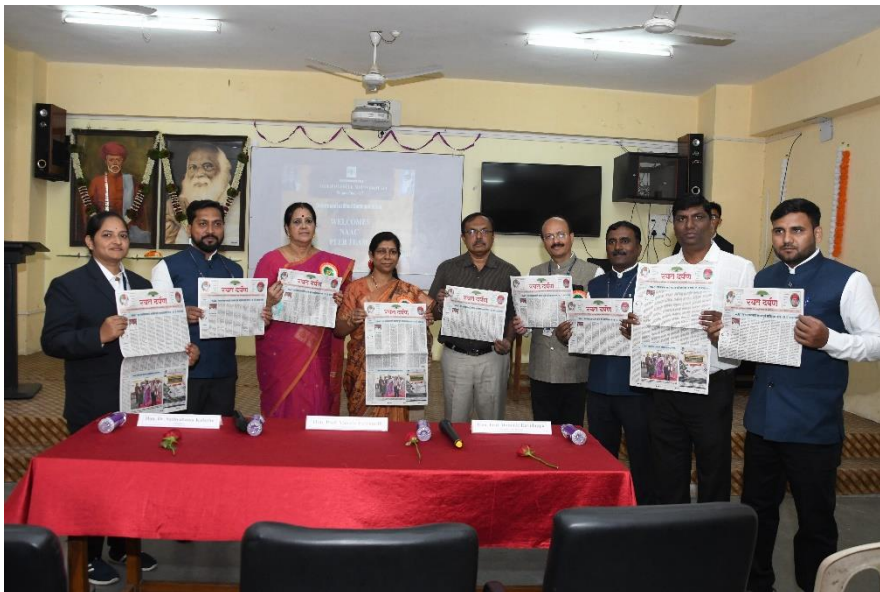
Release of Institutional Bulletin Rayat Darpan