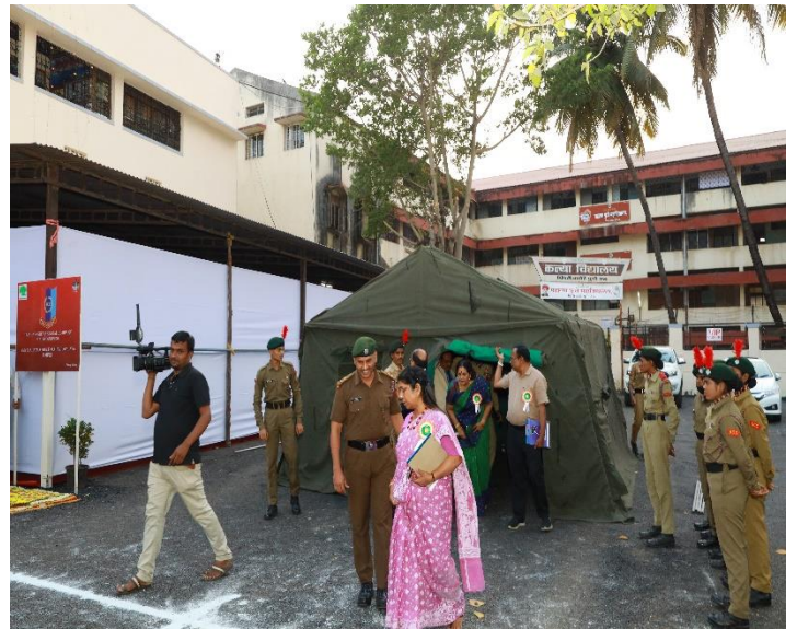
NCC Tent Demo