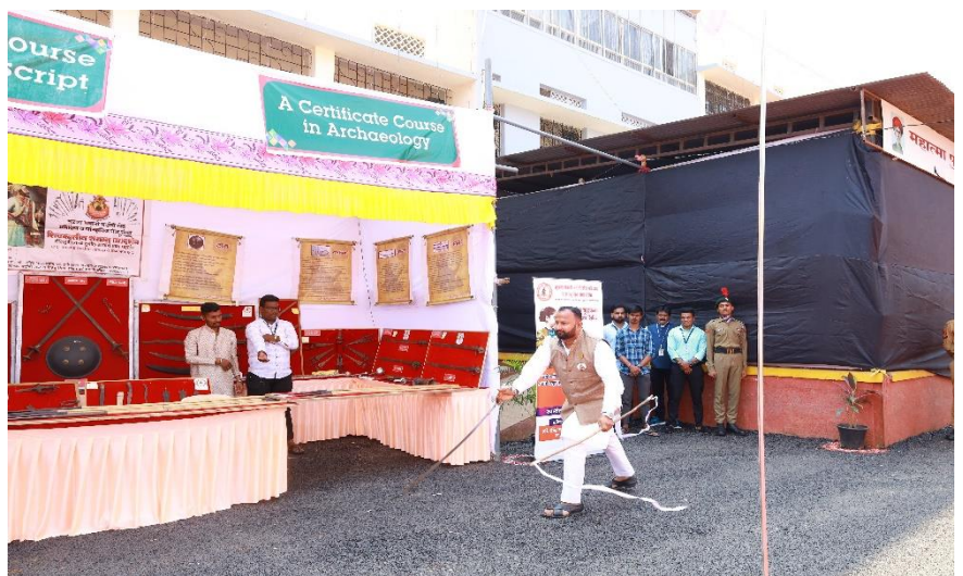
Visit to the Skill-based Courses Exhibition