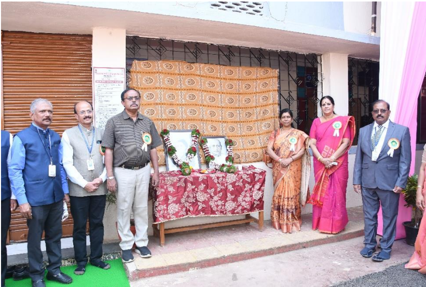
Pooja Offerings to the Images of Late Sardar Vallabh Bhai Patel and Late Indira Gandhi on Birth and Death Anniversaries respectively