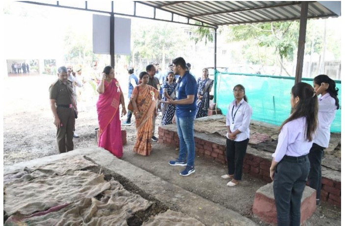
Visit to the Vermi-Culture and Compost Units