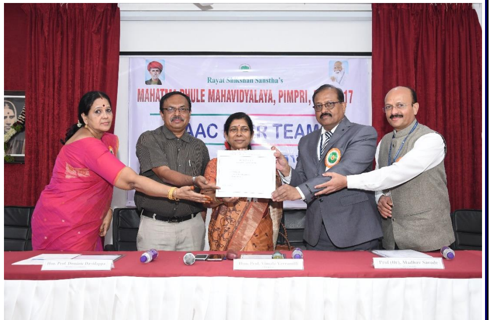
Handing over the Peer Team Report at the Exit Meeting