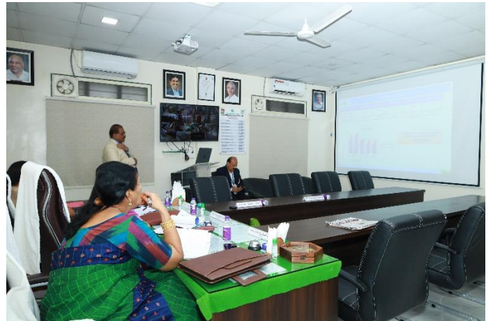
Principal's Presentation before the Peer Team