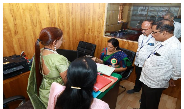
Visits to the Departments and Interactions with the Heads stream-wise and Administrative block