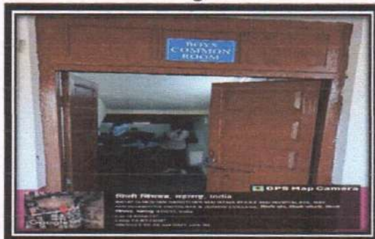
Boys common room