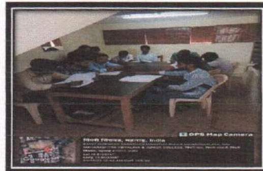
Boys common room